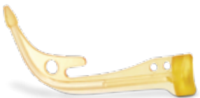
Figure 4 Production is compatible with 3D Systems' entire portfolio of NextDent® materials to facilitate full customization of dental devices. You can also choose from Figure 4 specialty materials for sacrificial tooling, jewelry casting, medical applications requiring biocompatibility and/or sterilization, and more.

See material selector guide and individual material datasheets for specifications on available materials.