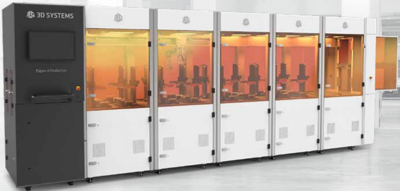
Figure 4 Production combines the design flexibility of additive manufacturing in configurable, in-line production cells to deliver a customizable and automated direct 3D production solution.

Industry's first customizable, fully-integrated factory solution for direct digital production