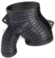
Figure 4 elastomeric materials are ideal for the production of functional rubber-like parts with excellent shape recovery, high tear strength, great for compressive applications and material malleability