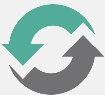
FIGURE 4 PRODUCTION RIVALS INJECTION MOLDED PART QUALITY WITH TOOL-LESS DIGITAL PRODUCTION TO DELIVER:

* Throughput improvement compared other 3D printing systems based on various use cases on Figure 4 Production; parts cost compared to traditionally manufactured parts and operations at a volume of 500 parts on Figure 4 Production